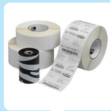
Consumables (labels, ribbons, PVC cards)