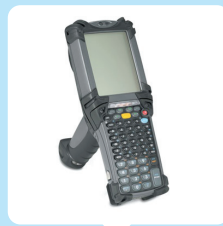
Data terminals & PDA