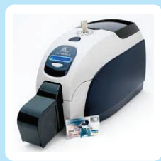
PVC card printers