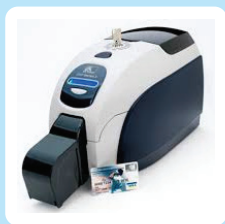
PVC card printers