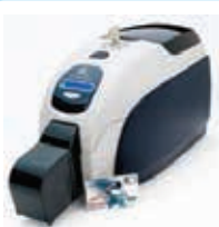
PVC card printers