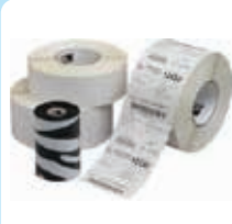
Consumables (labels, ribbons, PVC cards)