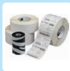
Consumables (labels, ribbons, PVC cards)