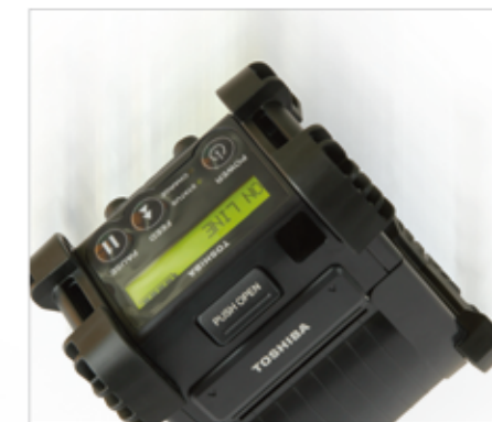
Robust and rugged, withstands a 1.8m drop on to concrete (1.5m for B-EP4)