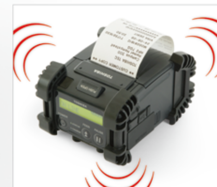
Wi-Fi certified (GH40 model)