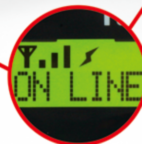
Backlit LCD user interface