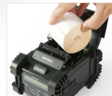
Market-leading media capacity for fewer roll changes